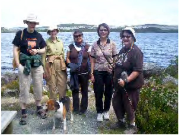
June 20, Octagon Pond

A message goes out by e-mail each week, giving directions to where we will be walking. If you prefer being informed by telephone, we'll call you. We carpool – it's no problem if you would like a ride.