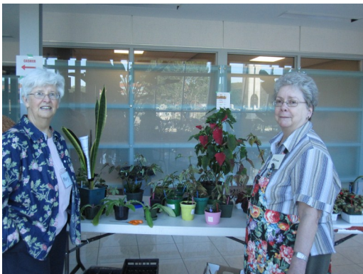
WAMUN Plant Sale