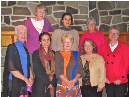
WAMUN Executive Board members