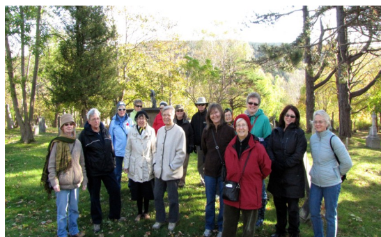
WAMUN January morning Coffee