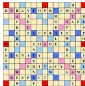
WAMUN Scrabble Group