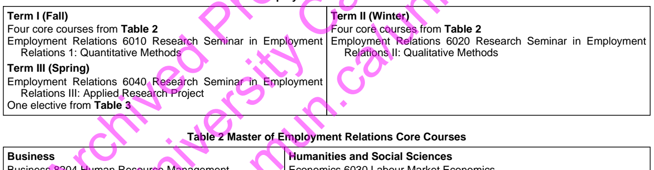
Table 1 Master of Employment Relations Schedule of Courses

The schedule of courses for the M.E.R. program is normally as follows: