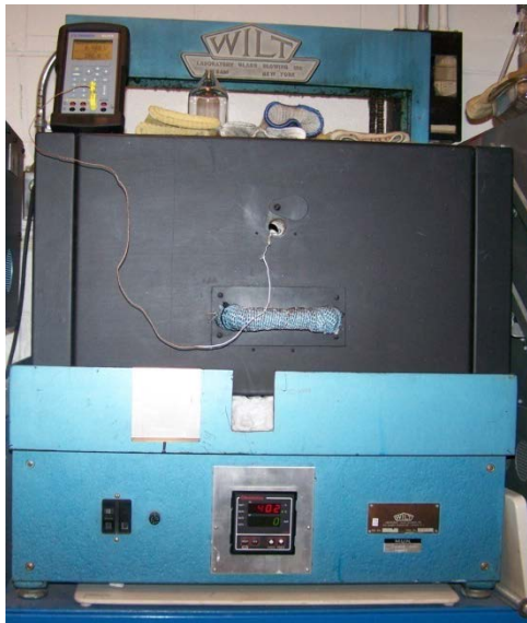
Wilt: Model 125