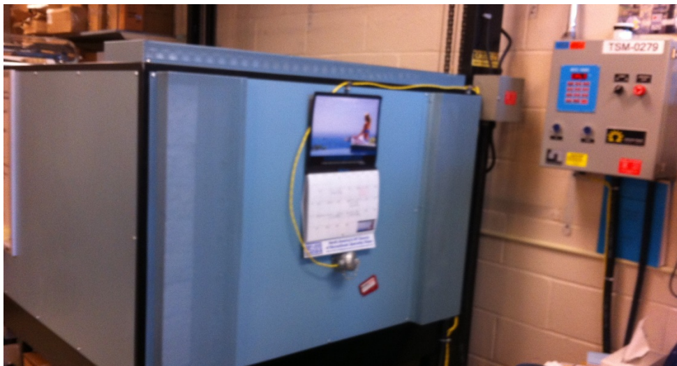
Euclid Annealing Oven