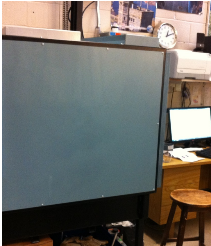
Euclid Annealing Oven