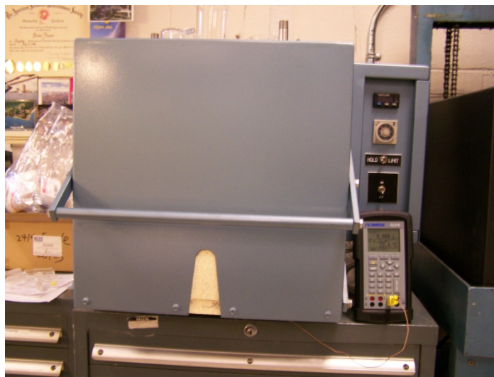
Wilt: Model 120-B