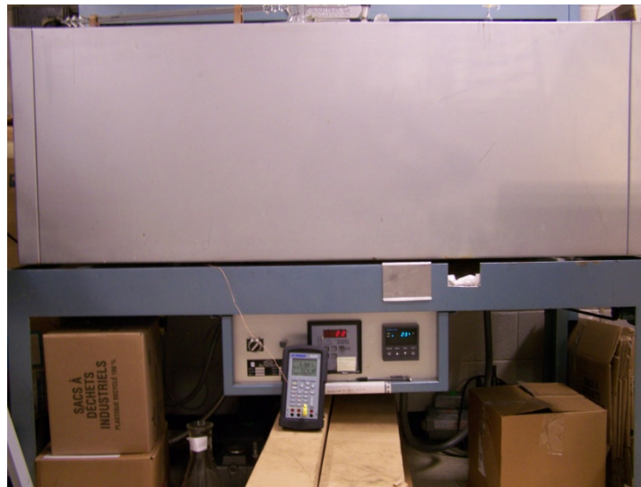
Wilt: Model 200