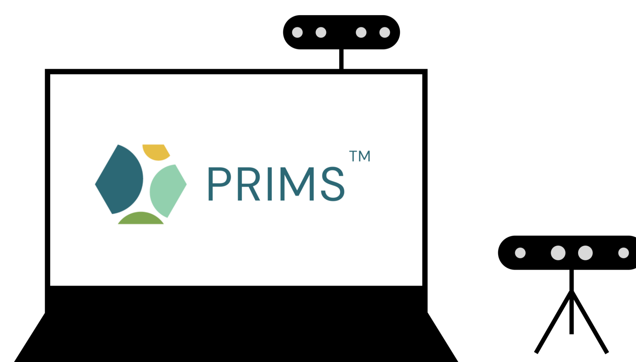
Figure 2: Previous hardware system of PRIMS – shown here the laptop computer and cameras mounted to screen and stand-alone tripod.