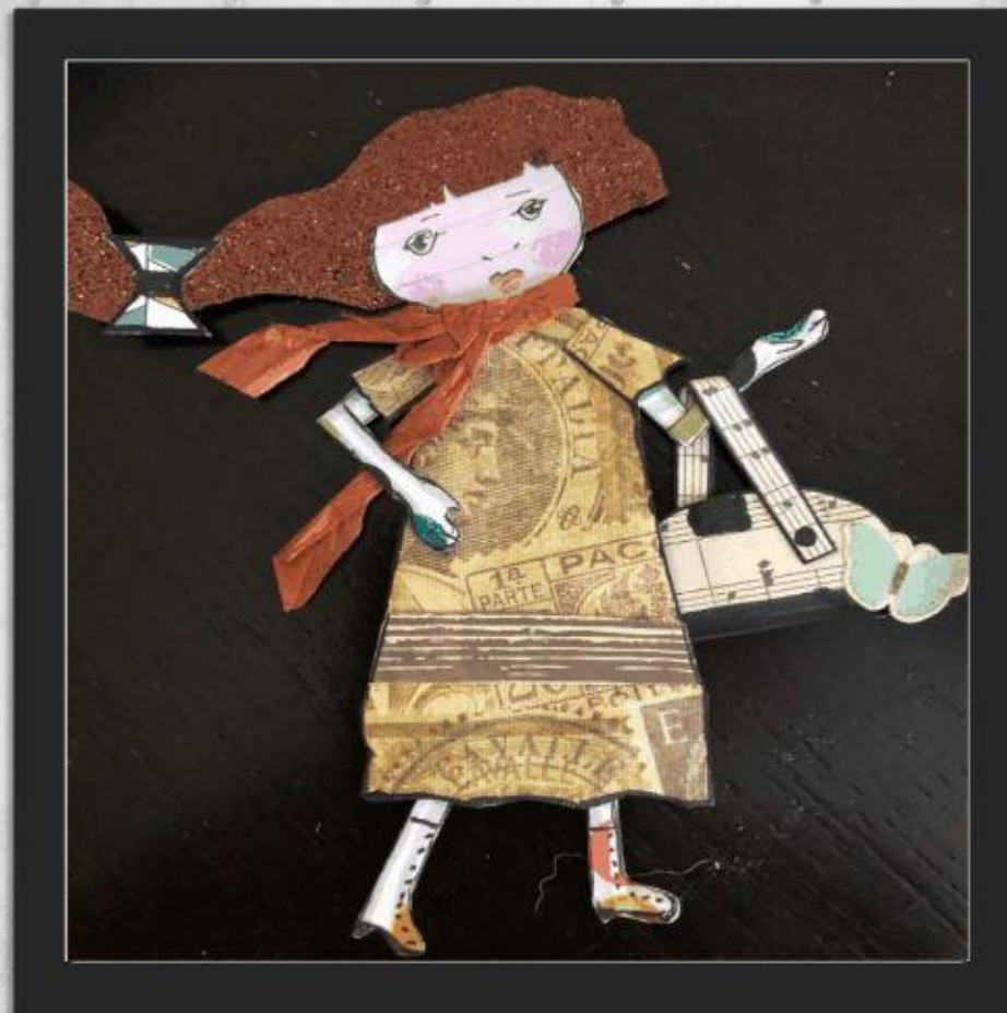
The first one.