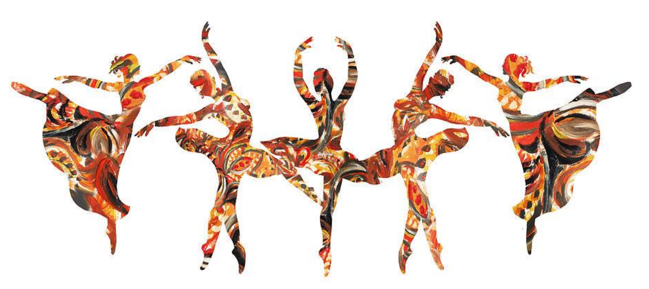
Passionate Floral Dance Abstract, Irina Sztukowski © 2015