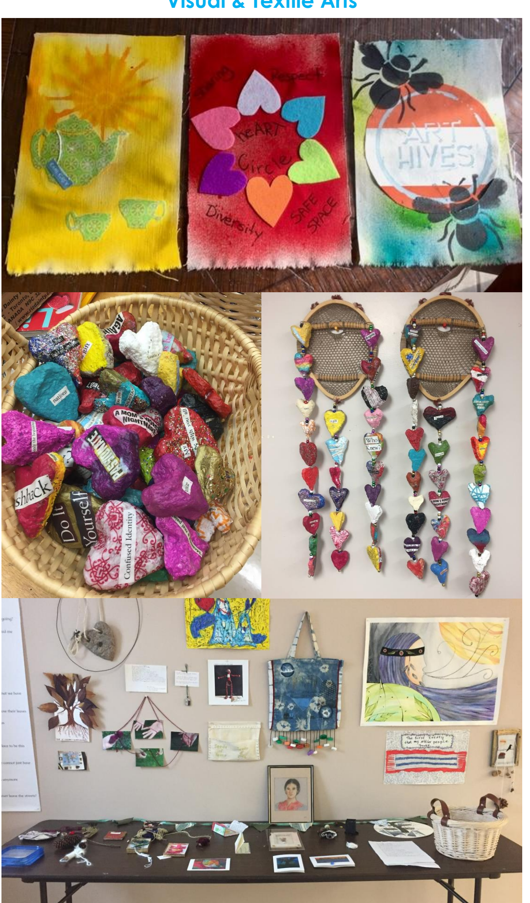
Visual & Textile Arts