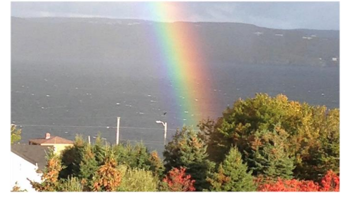
(The Detour, 2017)