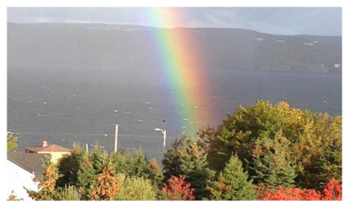
(The Detour, 2017)