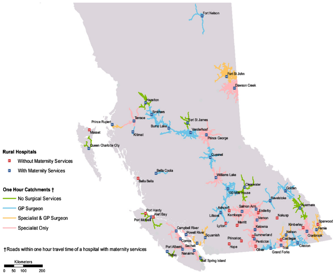
Fig. 2. 1 h surface travel time catchments and maternity service levels of rural BC hospitals, 2007.

This formula results in a “Rural Birthing Index” (RBI) score for each rural British Columbia community in our sample. Each score correlates to a recommended service level (see Table 2). We parameterized the model against existing stable rural maternity services in British Columbia (exhibiting these organizational properties) to calibrate the RBI scores to existing levels of service. We also scored communities that have changed service levels since 2000. We defined rural maternity service levels according to degree of local cesarean section capability as, in British Columbia, local surgical capability is the most important determinant of the proportion of women who will be able to deliver locally [47,48]. Furthermore it is important to recognize that cesarean section capacity in a community directly