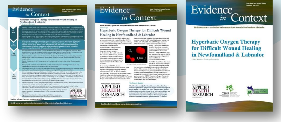
NLCAHR Annual Report | Page 21

This report is now complete. A dissemination event will take place in October 2012.