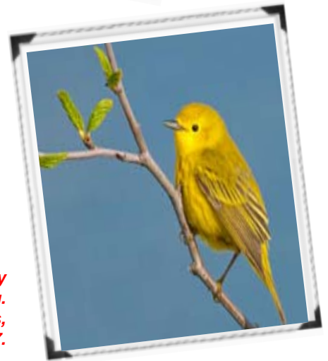
For more photos, see page 7.