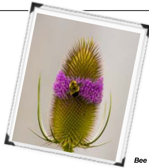
Bee on Thistle