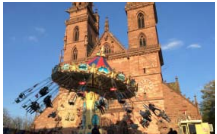
Clockwise from top: A strikingly colourful wreath on display at the Basel Christmas market. A scene from the Christmas market outside Basel cathedral. Trees at Hampton Court, UK.