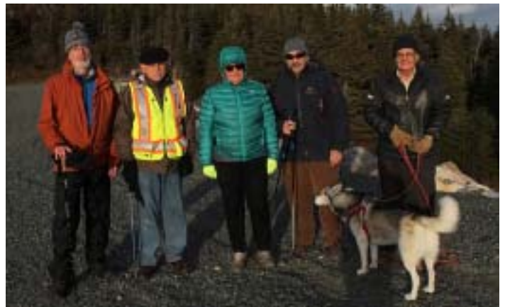
Outing Club on the Punch Bowl Trail