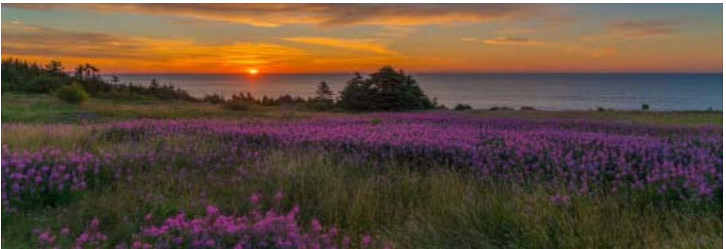
Additional photos from Herzberg presentation, NL Outdoors, held on November 20th. (Top) Moonrise. (Middle) Sunset. (Bottom) Yellow Lady's Slippers on the Northern Peninsula.