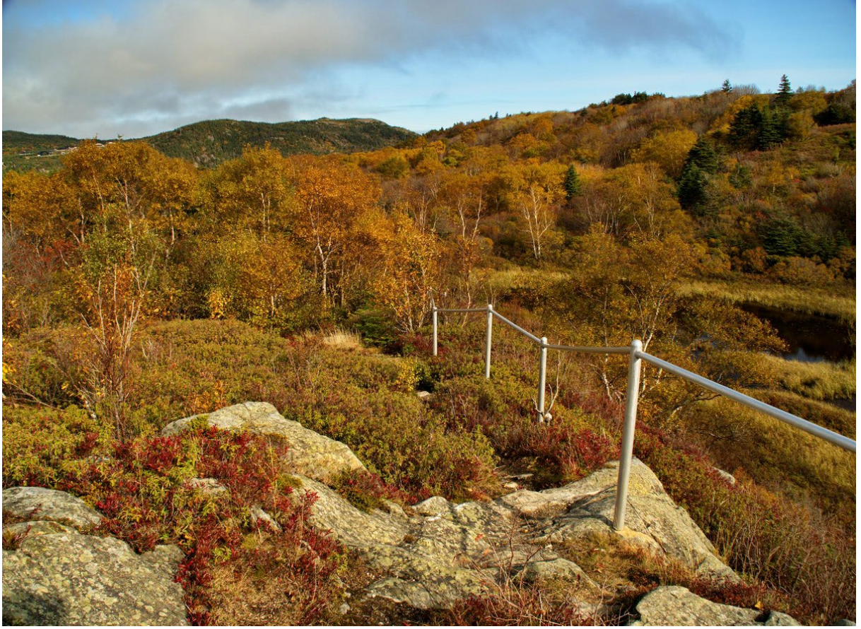
The slopes of Signal Hill: A path less followed