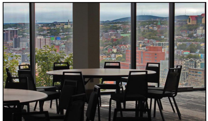
View from the Conference Centre