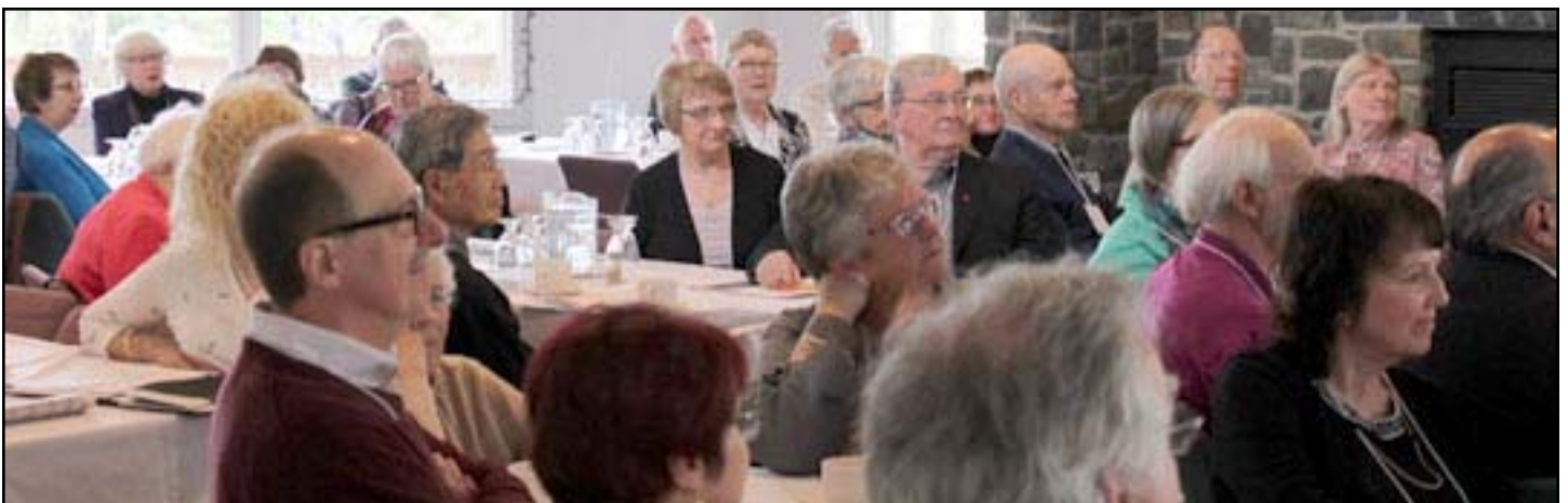
Attendees at MUNPA's AGM. See report on AGM's feature presentation – The NL Population Project , page 5.

Enjoy your summer! We'll be back in early fall.