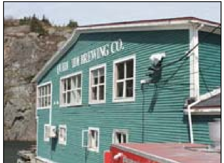
External view of Quidi Vidi Brewery.