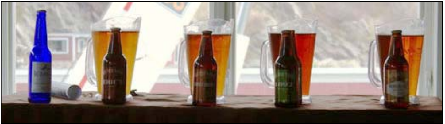
Beers awaiting tasters attending the Quidi Vidi Brewery tour and tasting event.