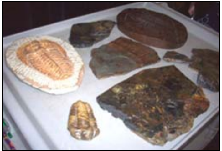
Examples of Ediacaran fossils of Avalonia on display.