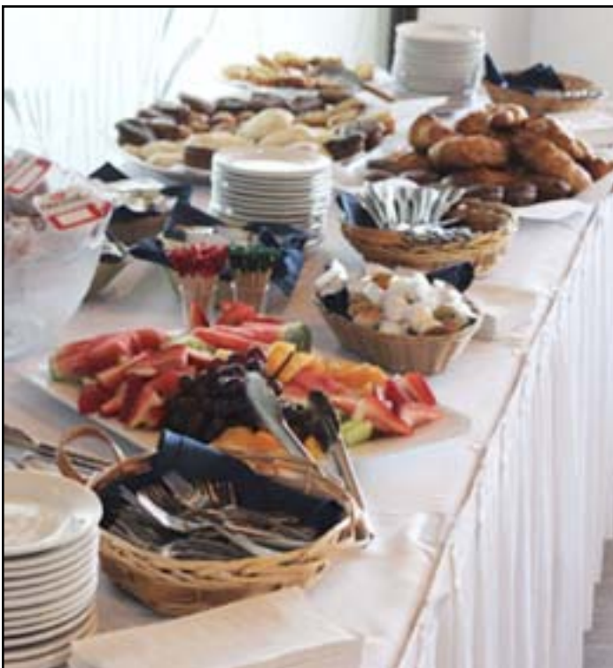
Spread prepared for the Coffee and Conversation event.

On April 23rd, MUNPA organized a coffee morning at the Fluvarium for the surviving spouses and partners of deceased MUN retirees. This afforded board members an opportunity to meet with them, hear about the problems they faced, and talk about what we were doing.