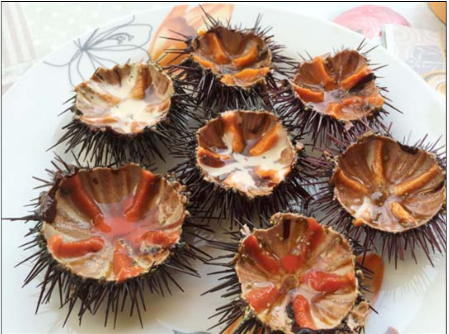
Travels in Italy: sea urchin breakfast.