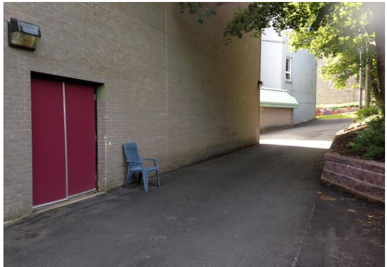
Entrance facing Mullock Street