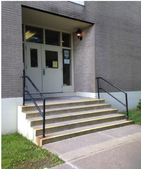
Entrance on Barnes Road

No automated button, but door bell that alerts office staff