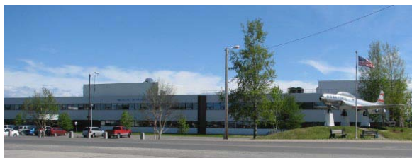
Happy Valley-Goose Bay Campus

There are currently two offices of the Labrador Institute, one located in Happy Valley-Goose Bay and the other in Labrador City. Both offices are co-located with the College of the North Atlantic. This co-location is unique, these two campuses being the only such co-location of College and University in the province.