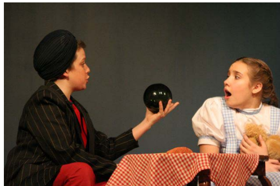
Queen of Peace Middle School Production