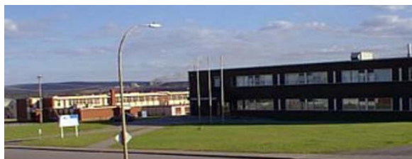
Labrador West Campus

In 1997, the university changed the focus of the Institute's activities and renamed it the Labrador Institute of Memorial University. As of today, the Institute has a permanent staff of six people with two positions currently vacant and in the process of being staffed.