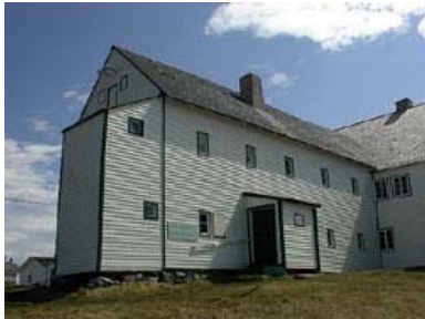
Moravian Mission, Hopedale