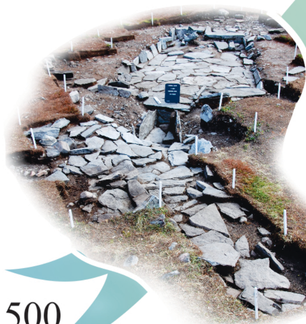
17th-century Inuit sod-walled winter house, excavated by archaeologists near Cartwright, Labrador. Main room at the rear, entrance passage in the foreground.