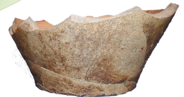
Base of European ceramic vessel recovered from Inuit sod-walled house in St. Michael's Bay