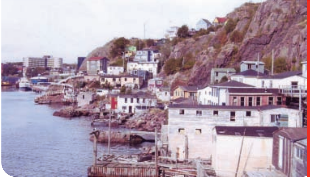
Public Sector Folklore students explored The Battery, a neighbourhood that is undergoing radical transition.