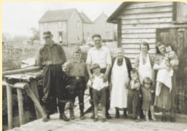
The CCRI project will make census data collected between 1911-1951 more accessible, offering insight into families in pre-Confederation like this Badger's Quay family of the 1930s.

Memorial University and the Newfoundland and Labrador Statistics Agency are working together on a massive project to digitize census data as part of the national Canadian Century Research Infrastructure (CCRI) project.