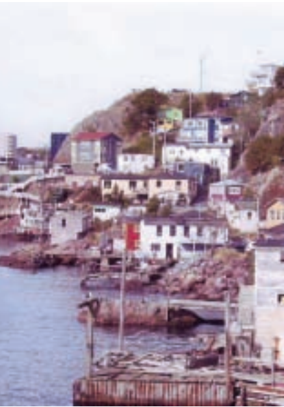
Students explored The Battery and designed an exhibit about the neighborhood – Page 5