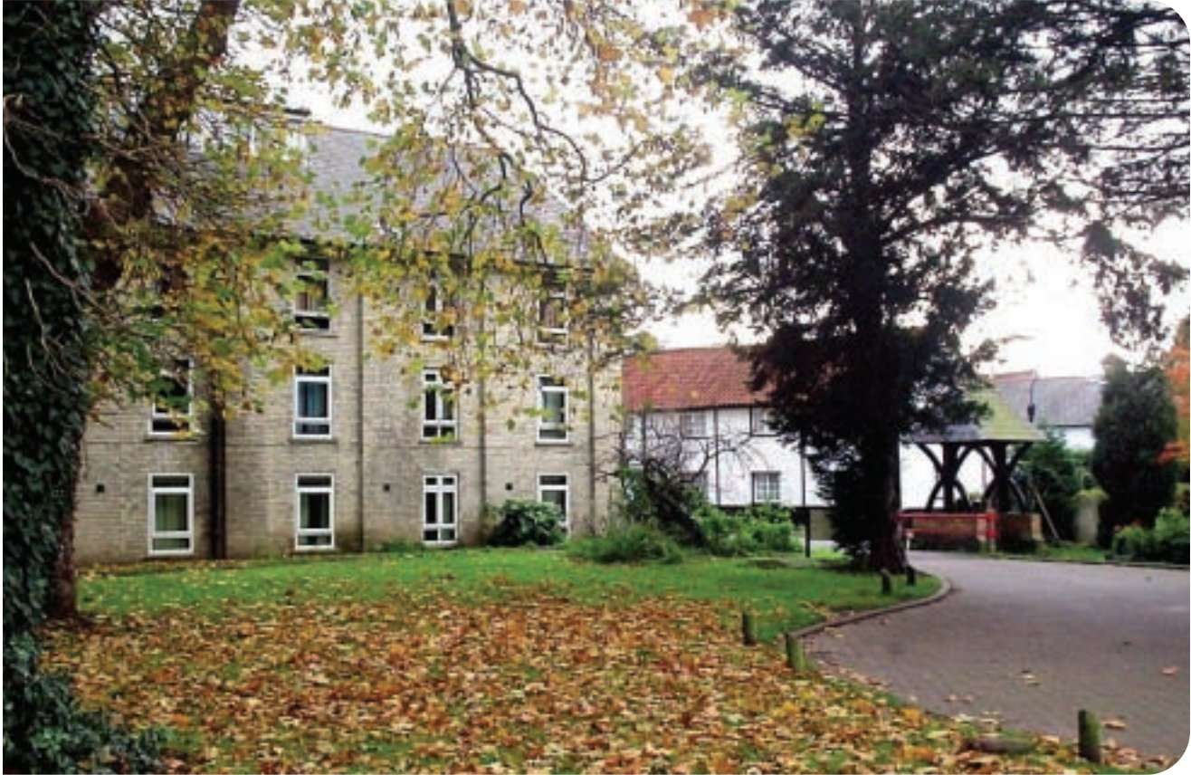
Memorial's Harlow Campus is located close to London – and affordable travel options let students see Europe and points beyond.