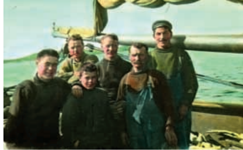
"Crew of Strathcona," July 1921, Maritime History Archive, PF-323.021