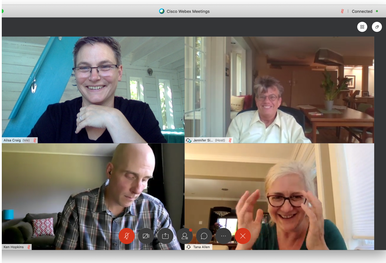
Working together to get it done—remotely

It is great to be able to talk about research success in the Faculty, and our faculty continue to do very well. Congratulations to the many grant and award recipients who have been notified over the summer, notably those who have received SSHRC Insight Development Grants , the Terra Nova Young Innovator Award, and recognition by the Royal Society of Canada . We will take time to celebrate these and other successes at a familiar event, A Fine Crowd , which will be held on September 24 in a re-envisioned way.