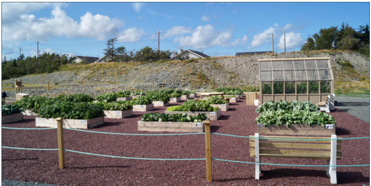
Whiteway community garden.