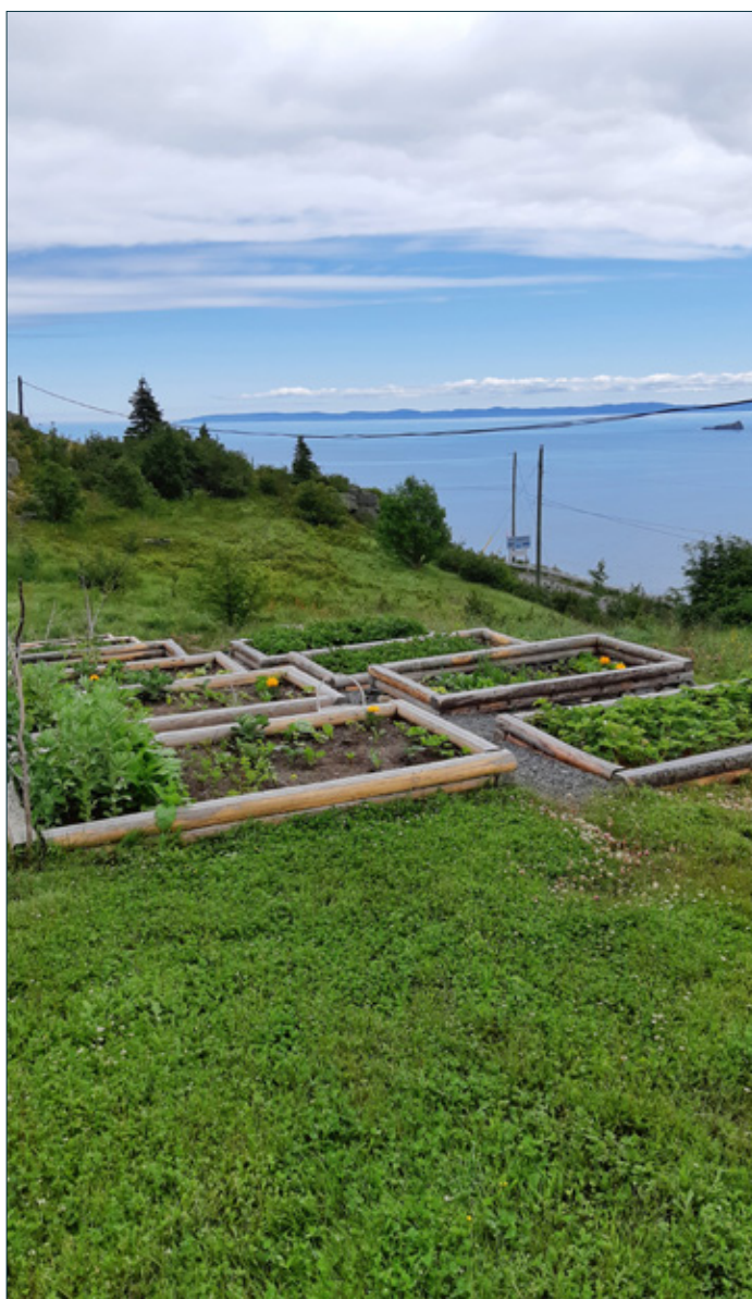
Vegetable garden.