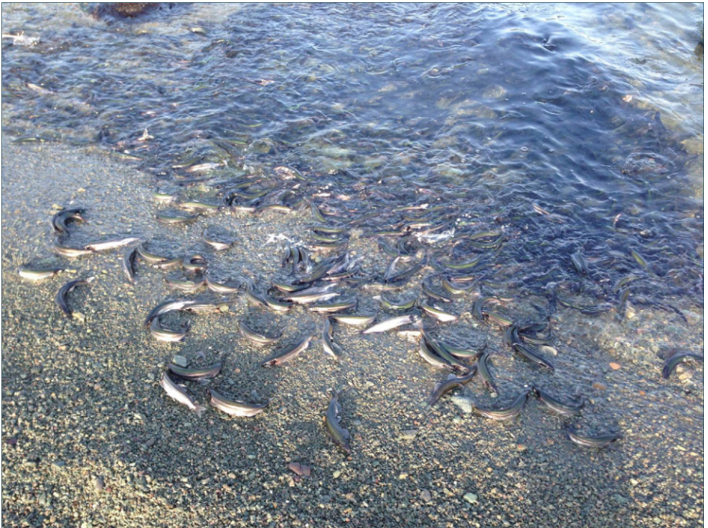
Capelin rolling.

Ed Spurrell is an avid fisherman, hunter, card and dart player, and enjoys telling stories about local oral history. He likes to keep busy with a variety of activities such as berry picking, splitting, filleting and salting fish, vegetable gardening, and smoking capelin.