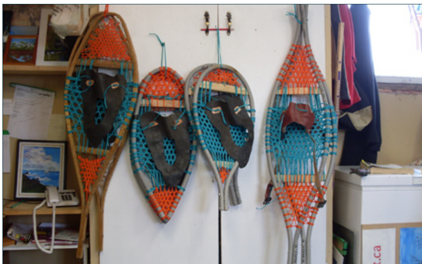
Handmade snowshoes.