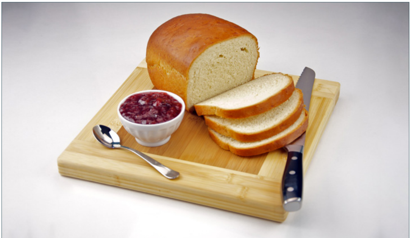
Bread with strawberry jam.

– DEVINE’S FOLK LORE OF NEWFOUNDLAND, 1937.