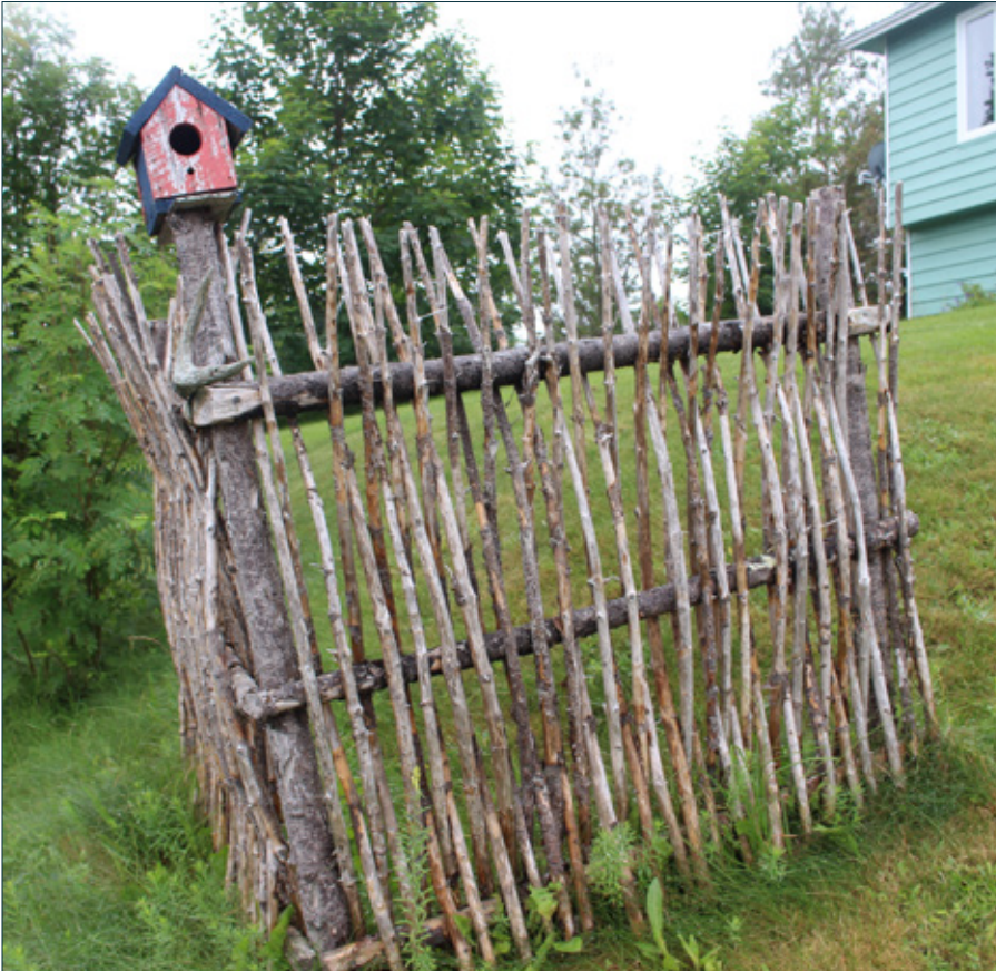
Wriggle fence, New Perlican.

Wriggle fences are one of Newfoundland and Labrador's most unique fences, but they have become increasingly more rare as construction of other simpler fences have grown in popularity. This traditional fence is made up of slender and pliable branches which are woven alternately through three horizontal longers or railings. It was known by a variety of names, including garden-rod fence, or riddle fence, or some variation of riddling or wriggling fence.