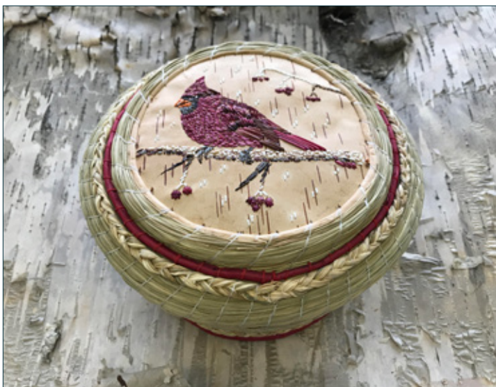
Sweetgrass basket with porcupine quill embroidered cardinal.