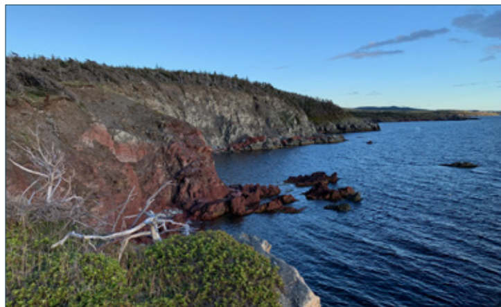
Northern Point Trail, Boar Point, Heart's Delight.

“I know this area well, so picking the hikes now is not hard because I know the full area, but it just ended up business-wise because I tried to partner up with other businesses and bring them into the circle and spread the love around with everyone. I try to choose somewhere where there’s a local restaurant close by so that we can do a hike and get something to eat.”