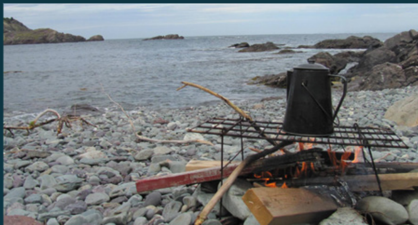
Tea on the landwash, Greenland , Cupids.

We believe that living heritage, traditionality, entrepreneurship, and community economic development are linked in Newfoundland and Labrador. Bringing tradition bearers into tourism activities, either as direct providers or in partnership with existing tourism operators, can extend the depth and breadth of visitor opportunities, and increase visitor spending and economic benefit to communities, thus contributing to community sustainability.