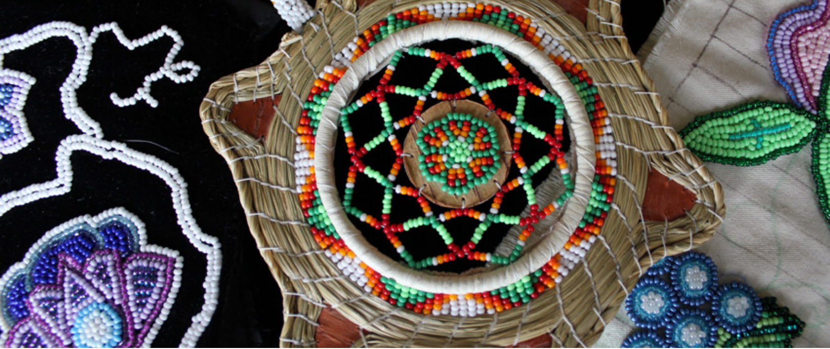
Beaded sweetgrass ornament by Burl Tooshkenig.