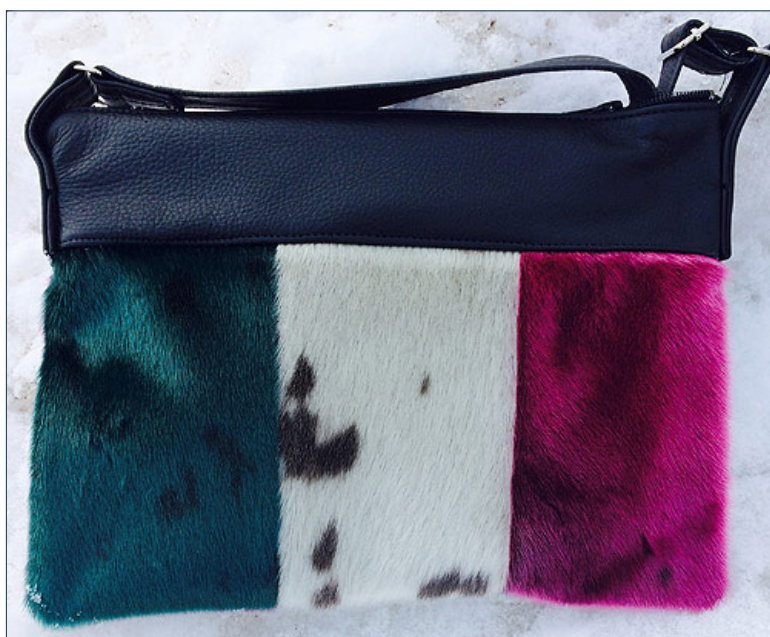
Sealskin purse in Republic of Newfoundland colours.