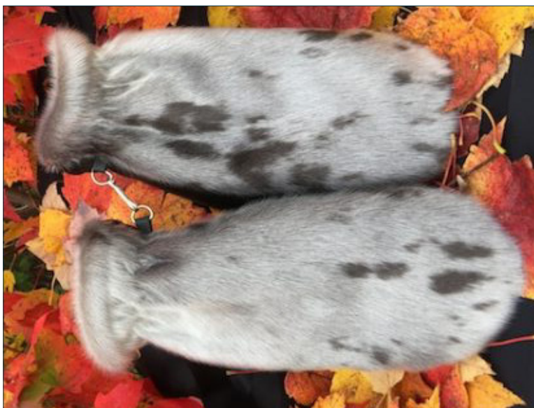
Sealskin mitts.