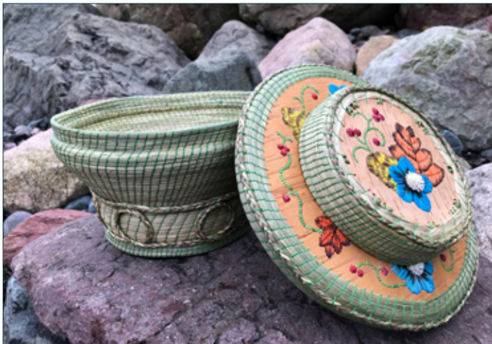
Sweetgrass basket with porcupine quill embroidered flowers.

Burl Tooshkenig is a traditional sweetgrass basket maker. The lids of the baskets are elaborately decorated with beading or embroidery. This knowledge is a dying art but Burl tries to teach it as often as he can.