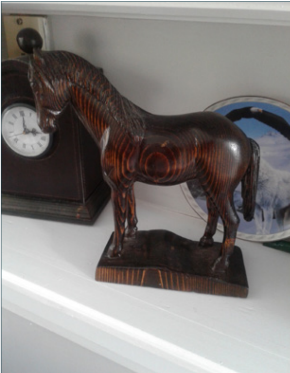
Wooden horse carving.