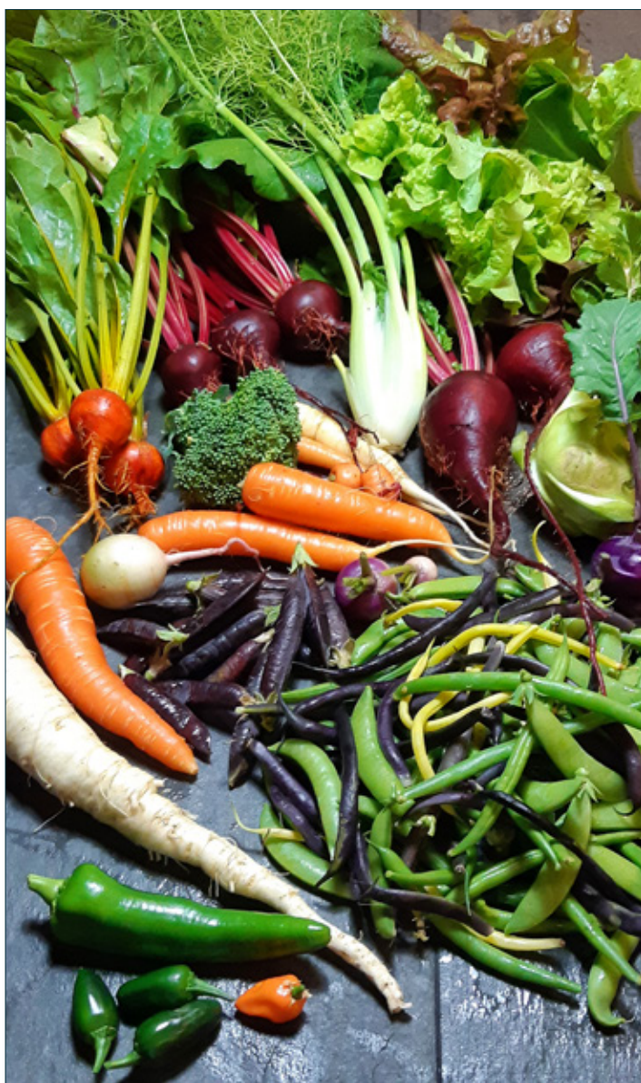
Vegetable harvest.

Greta is a home vegetable gardener with a YouTube channel 'Greta's Garden' which offers advice and tips to those looking to start their own gardens. Her picturesque property is secluded and overlooks the historic Carbonear Island. She aims to eventually turn her vegetable garden into a destination tourist stop.