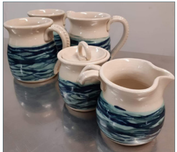
Plank Lane pottery.