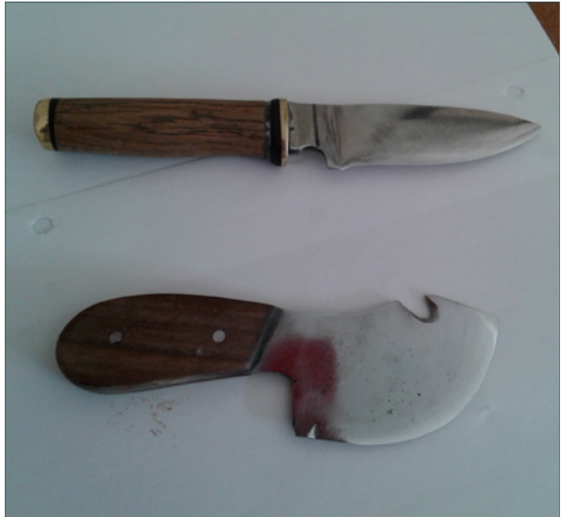
Handmade knives.

“I could always kind of recognize the images and shapes of the things, right? You look at a piece and you see something into it, you see an animal, like a weasel, or a mink, or maybe a head of a horse. Something like that, right? Then you go from there. Of course, you’d start off with a pocket knife. Then as I got a little bit more advanced, I had to make my own knives because you couldn’t hardly buy them and they were too expensive to buy anyway, so you had to make your own knives. Something like that, right? It was a hobby and a pastime, and like I said, you create something that you like. I was always interested in it. I like horses, and I like animals, and I like wildlife, right? So, why not carve it?”