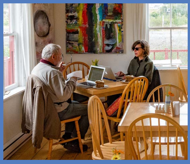
A couple enjoy lunch at Two Whales in Port Rexton.

I was one of three instructors and the closing instructor for new venture business models in BUSI 7600 and BUSI 9027: Current Topics in Entrepreneurship: Sustainable Tourism Management, which focuses on real ventures in rural Newfoundland and Labrador.