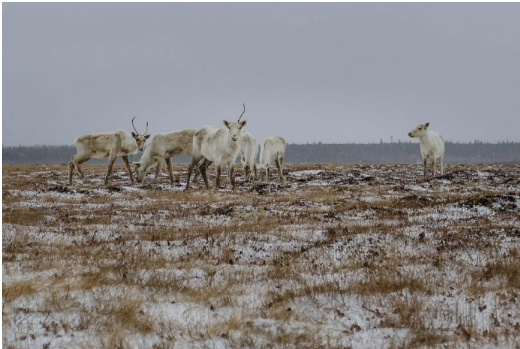
Caribou on the Island of Newfoundland.