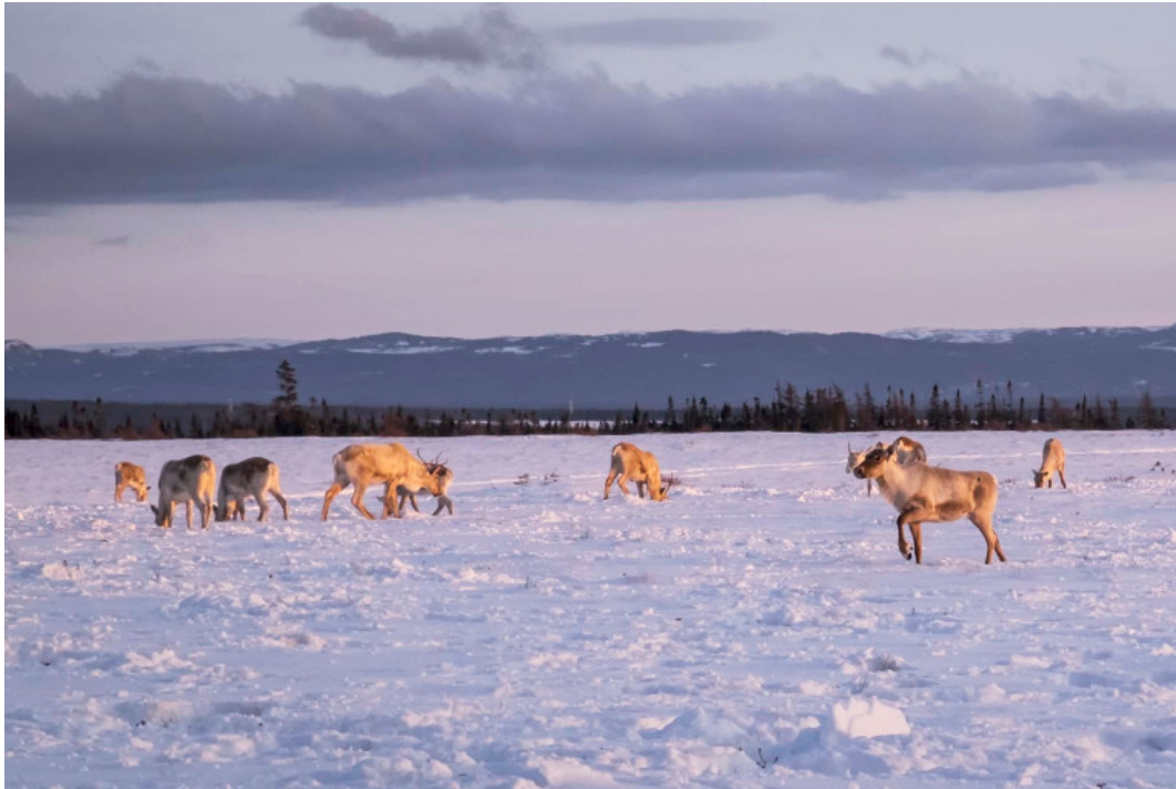
A herd of Newfoundland caribou.

The northwestern and central populations show a great deal of genetic variation, whereas the Avalon population shows almost none.