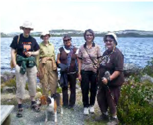
June 20, Octagon Pond

A message goes out by e-mail each week, giving directions to where we will be walking. If you prefer being informed by telephone, we'll call you. We carpool – it's no problem if you would like a ride.