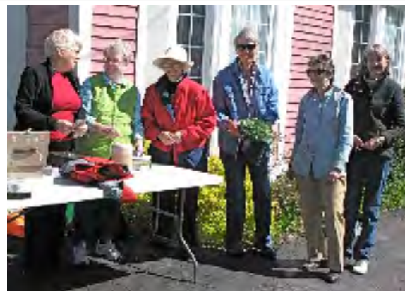
Some of our happy volunteers at the spring plant sale which sold out in 2 hours