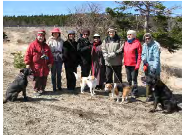
April 18, exploring Pippy Park.

However, we do walk, and we walk (nearly) every Saturday at the same time, 1:30 pm. If precipitation is predicted, we dress accordingly and, more often than not, we get in a healthy hour-long walk before the weather really sets in.