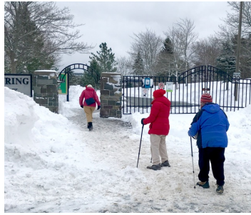
Saturday group, Bowring Park, Dec. 6