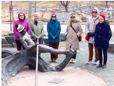
Monday group, Quidi Vidi, April 15

When the trails are too icy to walk on, we often walked on city streets or on the paved roads of Bowring Park.