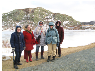
Monday group, Signal Hill, Feb. 19