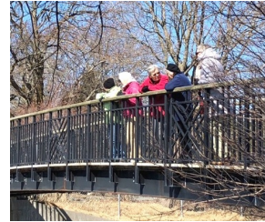
Monday group, Bowring Park, March 25

Since the beginning of winter, the Monday and Saturday walking groups have been out