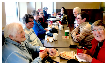
Saturday walk cancelled. Jan 19, because of snowstorm