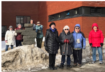
Saturday group annual Inukshuk photo, Jan.12