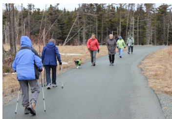
Saturday group, Welland Park, March 30