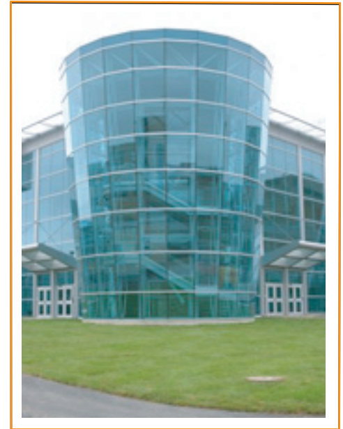
Inco Innovation Centre