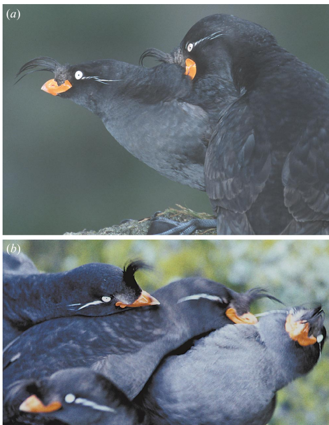
Figure 1. Stereotyped 'ruff sniff' courtship. Individuals place their bills within the nape feathers of a display partner, a region of the body that is strongly scented. (a) Display between a courting pair. (b) Group display.

observations suggest that both are seasonal. In a captive colony, 'ruff sniff' behaviours are absent during non-breeding (S. Devereaux, personal communication). Also, a detailed description of both live and dead birds, collected following an unusual mid-winter encounter at sea (Dick & Donaldson 1978), fails to mention scent, suggesting that odour may have been mild or lacking altogether. Finally, to human observers, odours of both wild and captive crested auklets wane at the end of the breeding season, coincident with moult and the loss of other ornaments (crests, orange beak plates; J. C. Hagelin, unpublished data).