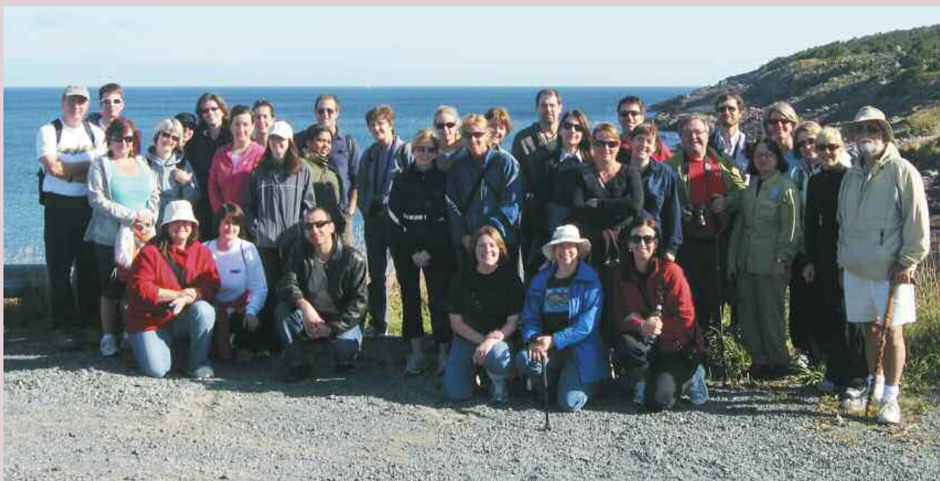
Hikers remembered a colleague and friend along the Blackhead-Cape Spear section of the East Coast Trail during the Ninth Annual John Ross Memorial Hike this past September.