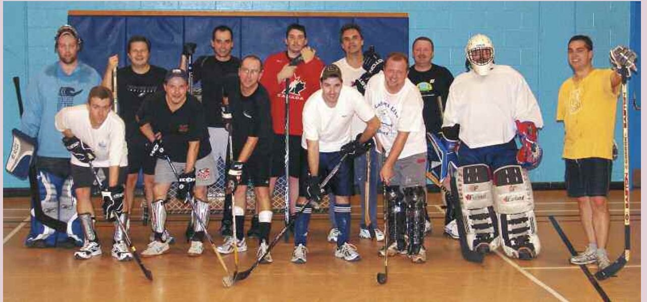
The Marine Institute ball hockey league has been meeting regularly on Thursday nights since 1988.

“I would describe the atmosphere as inviting and addictive. Once you come and play a couple of games, you are hooked and once you play for a season ... then you become