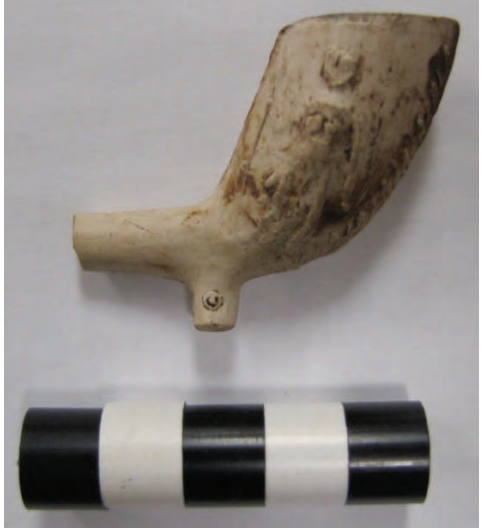
19th century clay pipe, Dumpling Island 1 (FlBf-04).