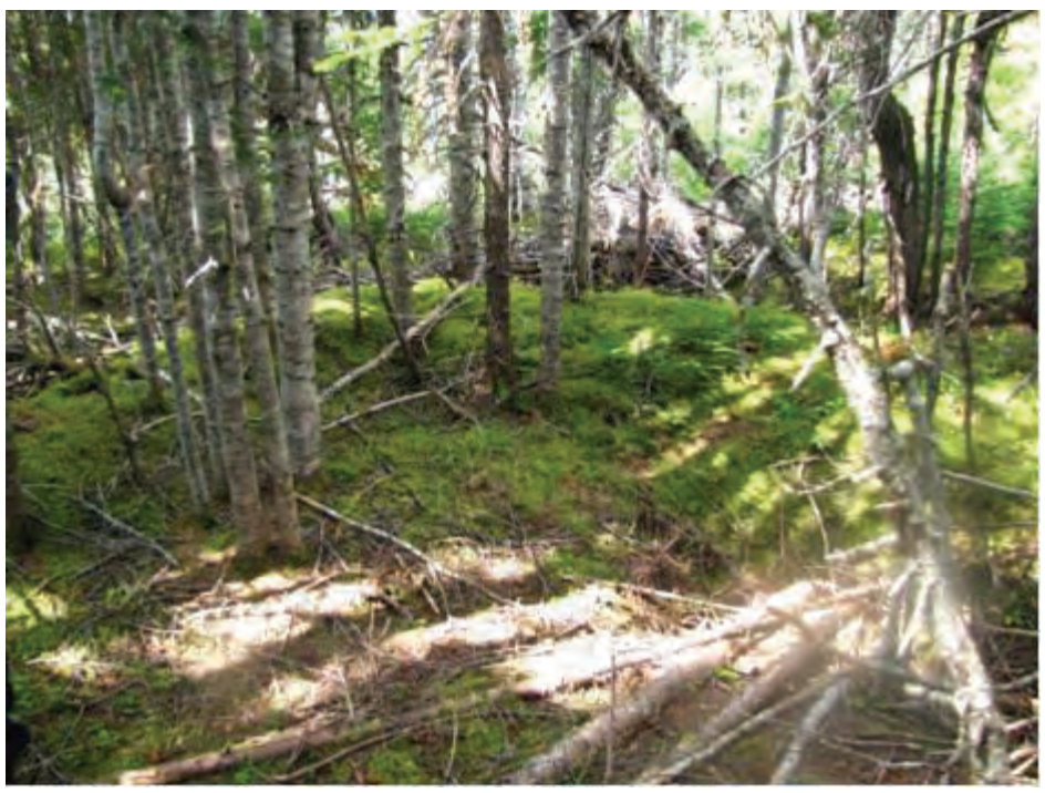
19th century Metis House, White Bear River (FjBi-02).