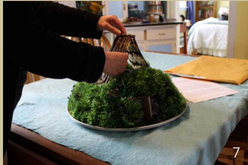
Fig. 6: View from interior of outer doorway (photo by Kelly Drover, 2017). • Fig. 7: Model of Crocker's Root Cellar made by Reagan Hopkins (photo by Kelly Drover, 2017).

sod. The original wood rafters have since disintegrated, resulting in some minor shifting of the roof structure. Tracy Crocker, a descendant of the original Crocker builders, explains: