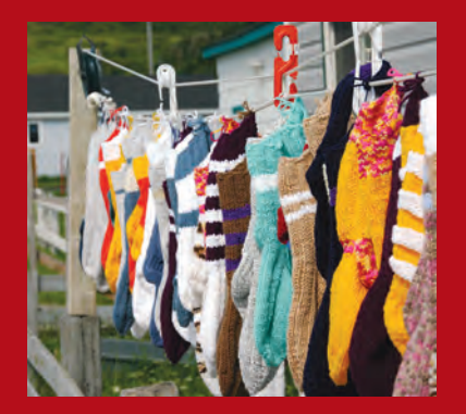
Photo: Patsy's wool socks for sale, Trout River, photo courtesy John MacDermid.