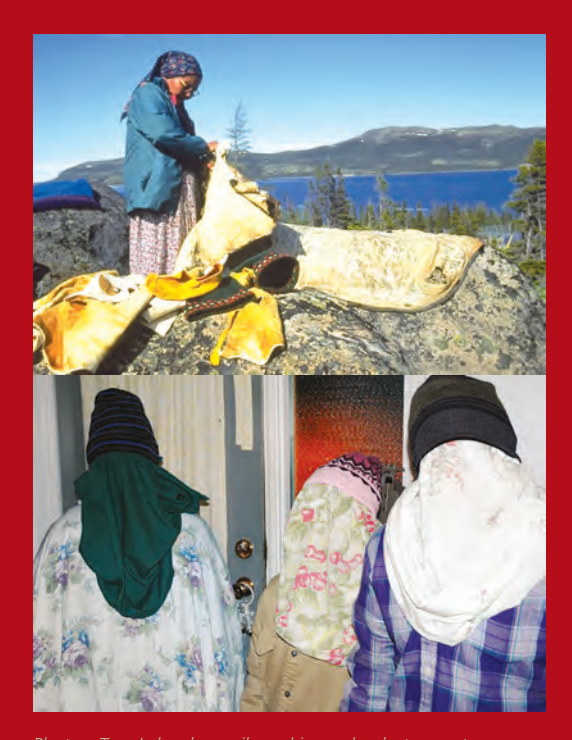
Photos: lop: Labrador caribou skin work; Bottom: Young janneys, Christmas in Mainbrook.