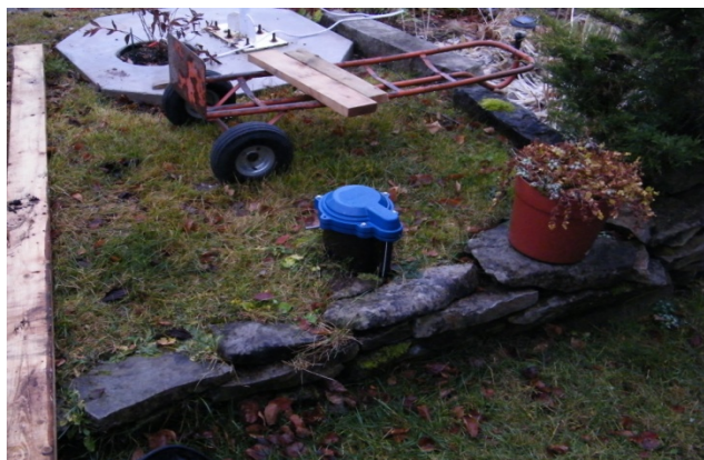
Figure 2: This drill well became contaminated by total coliform in fall

Figure 1 shows two wells, which were contaminated by total coliform in summer and fall. Well 'a' also had fecal coliform in fall. Physical and chemical parameters of well 'a' were within normal limit. Water samples of both sources were visibly clear and transparent and owners were happy with its taste, odor and color. Well 'a' was close to a river bank and surrounding land sloped towards the river. Possibly the well remained contaminated by surface run off from surrounding highland. Well 'b' is close to wetland; however, the source of contamination could not be ascertained during our survey. Physical and chemical parameters of well 'b' showed high turbidity, iron and manganese.