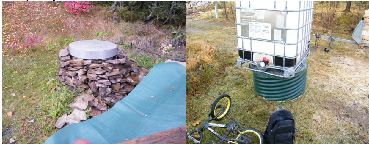
a) b) Figure 1: These two dug wells had total coliform contamination in both seasons and in addition well 'a' had fecal coliform