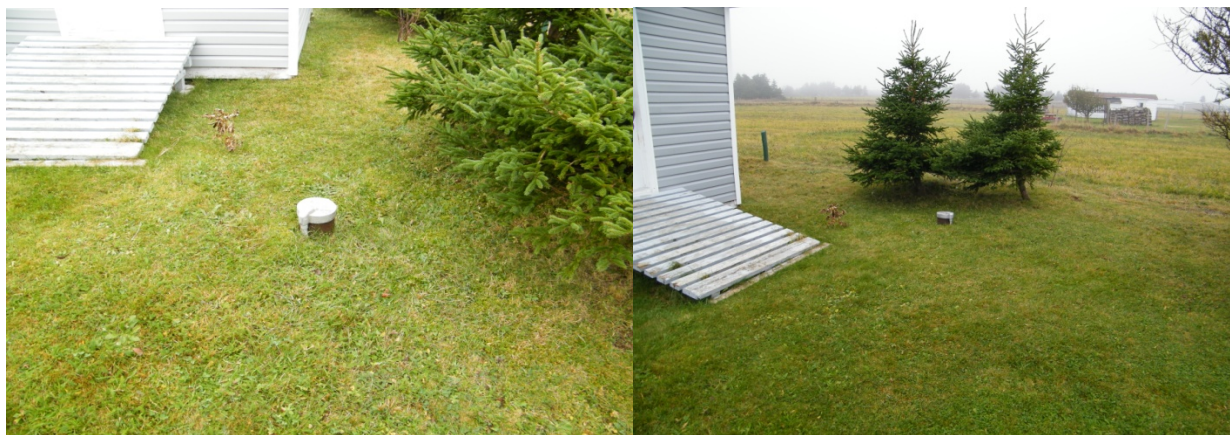
Figure 4: Drill well remained free from microbial contamination in summer and fall

The dug well shown in Figure 3 was highly contaminated as indicated by total coliform counts measured in the summer and had bacterial overgrowth in fall. The well was covered with Styrofoam and the color of the water was brownish. Water was used for cooking, bathing and washing. In the kitchen an aerator was used before using water in cooking. The well owner did not monitor the well regularly and the last proper cleaning with Javex TM (sodium hypochlorite) was done five years prior. A walk through survey identified a boggy marshy land nearby; however, this could not be ascertained as its link to poor quality water. Chemical analysis showed the highest color (135 TCU) and high turbidity (7.7 NTU) levels of all the wells sampled. This provides supporting evidence of surface contamination and hence high microbial level. The water also contained high iron and manganese.