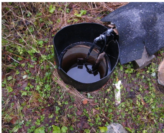
Figure 3: Dug well – summer sample was highly contaminated by total coliform (80) and fall sample had bacterial overgrowth.

The well shown in Figure 2 was free from any form coliform contamination in summer, but in fall it became contaminated (total coliform). Its physical and chemical parameters were within normal limit. Apparently the well head looked secured and properly maintained; however the contamination of the fall sample indicated possible underground seepage from the surrounding land. The slope of the surrounding ground was towards the well. The owner did not monitor the well regularly.