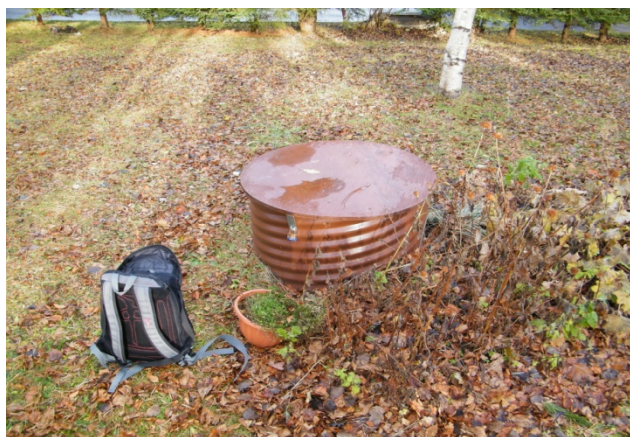
Figure 5: Only dug well in our study showing negative coliform in both summer and fall

The drill well shown in Figure 4 had a secured well head and the surrounding area was a properly maintained, flat surface. The well was located at least 100ft from the house, but close to the shed (seen in the figure). Water was regularly (once a year) monitored by the well owner. However, physical and chemical analysis showed little elevated level of turbidity (1.8 NTU) and manganese (0.31 mg/l).