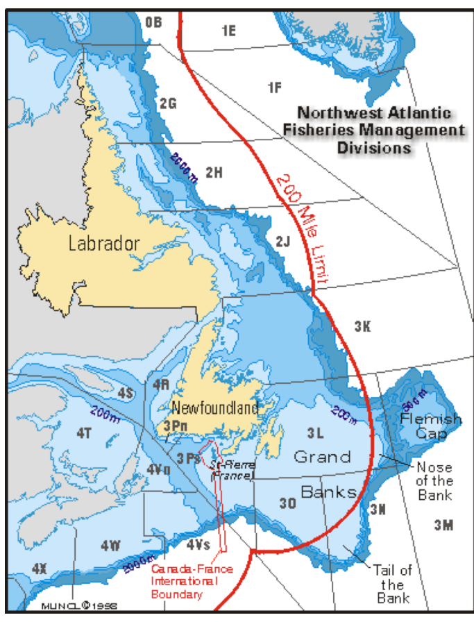
Figure 1: Northwest Atlantic Fisheries Management Fishing Zones

Since 1996 holders of vessel based, key species licences in the inshore sector (less than 65 feet) and their commercial fishing enterprises may be designated as Core or Non-Core enterprises (DFO, 2013a; PFHCB, 2013). A "Core Enterprise" is "a fishing unit composed of a fish harvester who is the head of the enterprise, registered vessel(s) and licences he holds, and which was designated as such by DFO in 1996" (DFO 11, 2013). Enterprises designated as Core