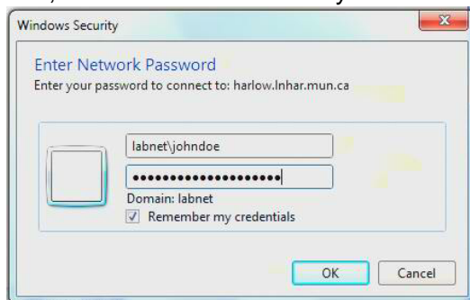
Domain/Network Authentication Window – example information inputted

After you have properly authenticated, it will ask you to confirm that you want the printer driver installed on your computer – Click "Install driver" otherwise you will not be able to print.