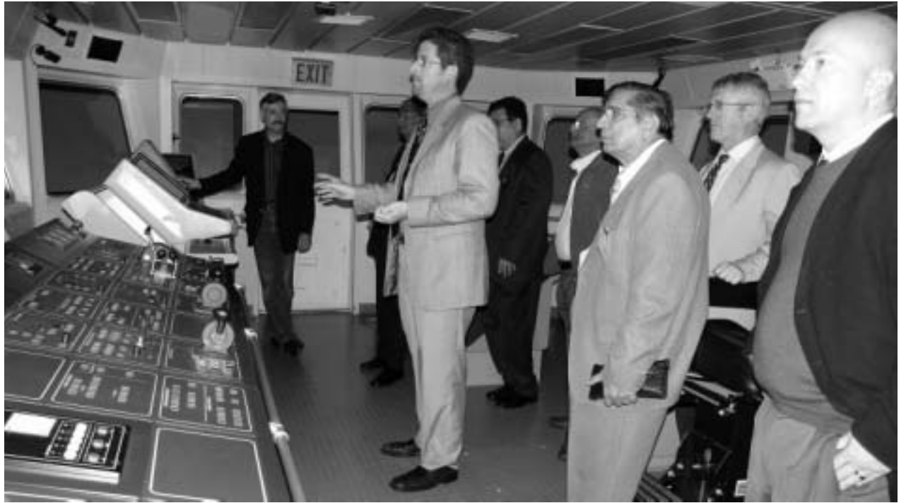
Visitors from India experienced the MI bridge simulator.