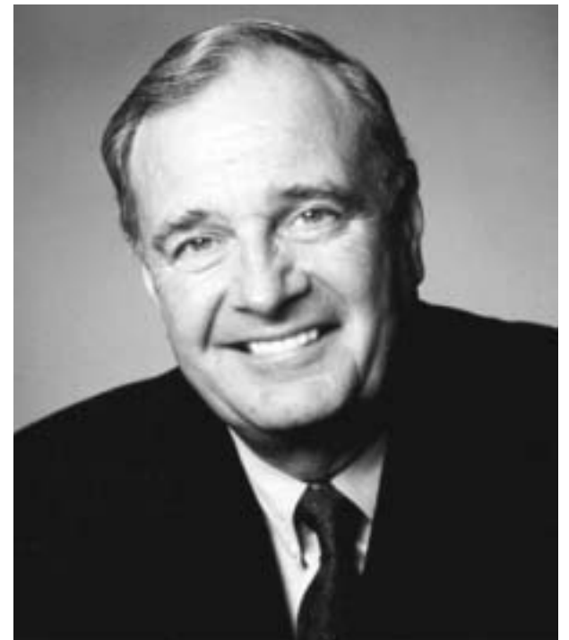
Former prime minister Paul Martin

"Lights! Camera! Action!" versus "Grab your pen and paper!" – which one sounds more exciting?" she said. "As