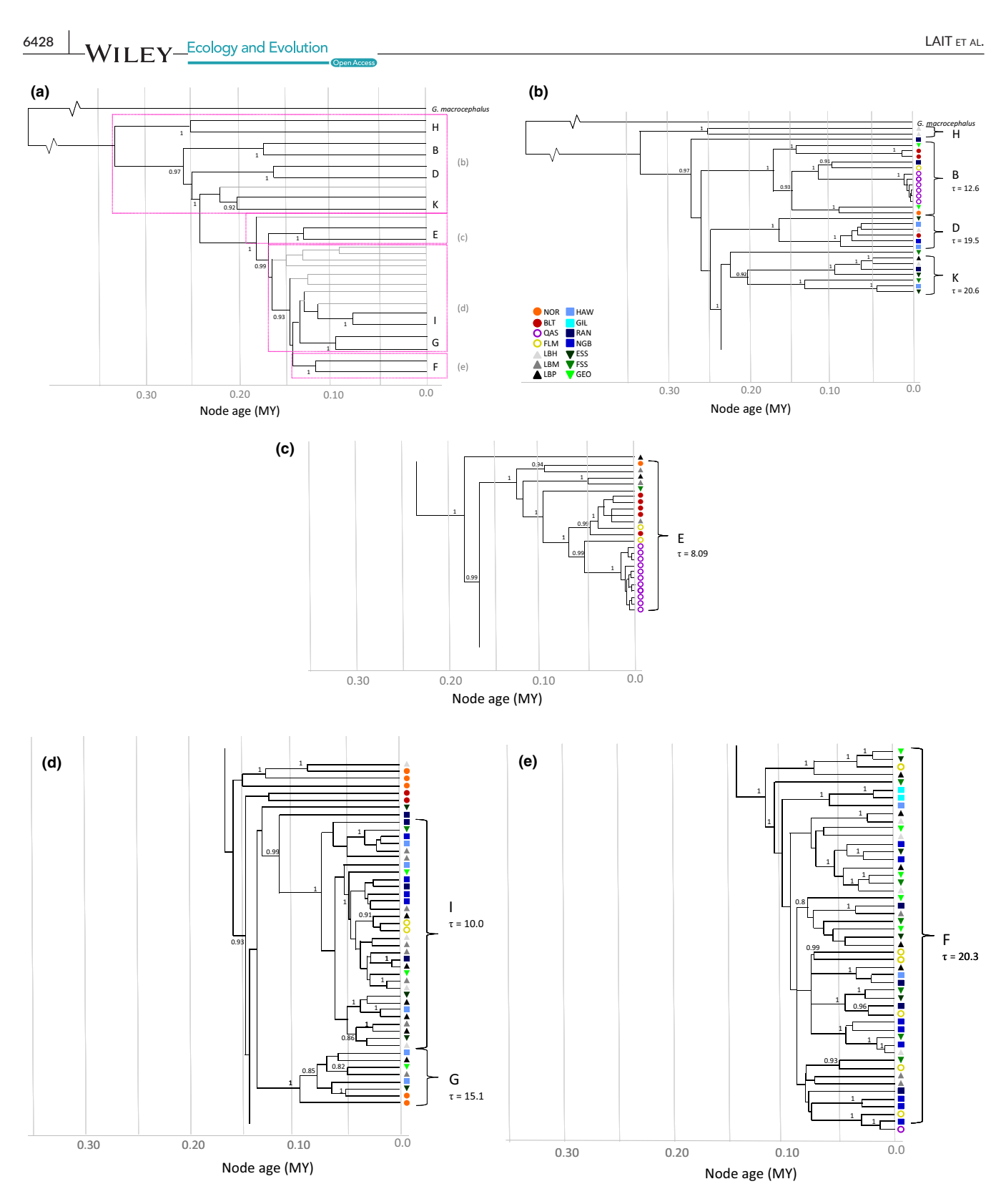
FIGURE 3 Clock-calibrated Bayesian analysis of complete mitogenomes from 153 Atlantic cod. The horizontal axis shows time since separation in million years. Posterior probabilities \geq .8 are given. (a) Simplified Bayesian analyses showing the eight major haplogroups B-K. Gray lines lead to mitogenomes that do not fall into one of the eight major haplogroups (labeled) with high confidence, and (b-e) a detailed view of the Bayesian analysis for each of the eight major haplogroups

Atlantic sampling locations (Table 3a), and the absence of isolation by distance among the Northwest Atlantic samples. The separation of trans-Atlantic populations is incomplete—in many comparisons