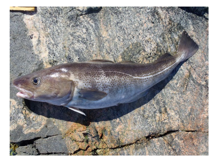
FIGURE 1 Atlantic cod ( Gadus morhua ) caught near Hopedale, Newfoundland and Labrador, Canada.

Atlantic cod (Gadus morhua L. 1758; Figure 1) are demersal omnivores found along the continental shelves of the North Atlantic Ocean. Offshore populations commonly migrate in large aggregations between spawning grounds and feeding grounds to find their main food source, capelin (Mallostus villosus; Lear & Green, 1984; Pálsson & Thorsteinsson, 2003; Templeman, 1979). The distribution extends as far south as Cape Hatteras (North Carolina), northward through New England and Atlantic Canada, across the continental shelves of Greenland and Iceland, through the North Sea, and into the Baltic and Barents Seas (Figure 2). Of particular ecological interest are three landlocked coastal fjords on Baffin Island, Nunavut, Canada: Lake Ogac off Frobisher Bay, and Lakes Qasigialiminiq and Tariujarusiq off Cumberland Sound (Hardie, 2003). These lakes are described as meromictic, with a freshwater layer at the surface and saltwater of varying concentration underneath (Hardie, 2003; McLaren, 1967). Their populations are estimated at no more than 500-1,000 cod each. These fish survive in extremely cold and seasonally frozen waters, they mature at a much greater size and age than their marine counterparts, and they feed on echinoderms, molluscs, polychaetes, and other cod (Hardie, 2004; Hardie & Hutchings, 2011; Patriquin, 1967).