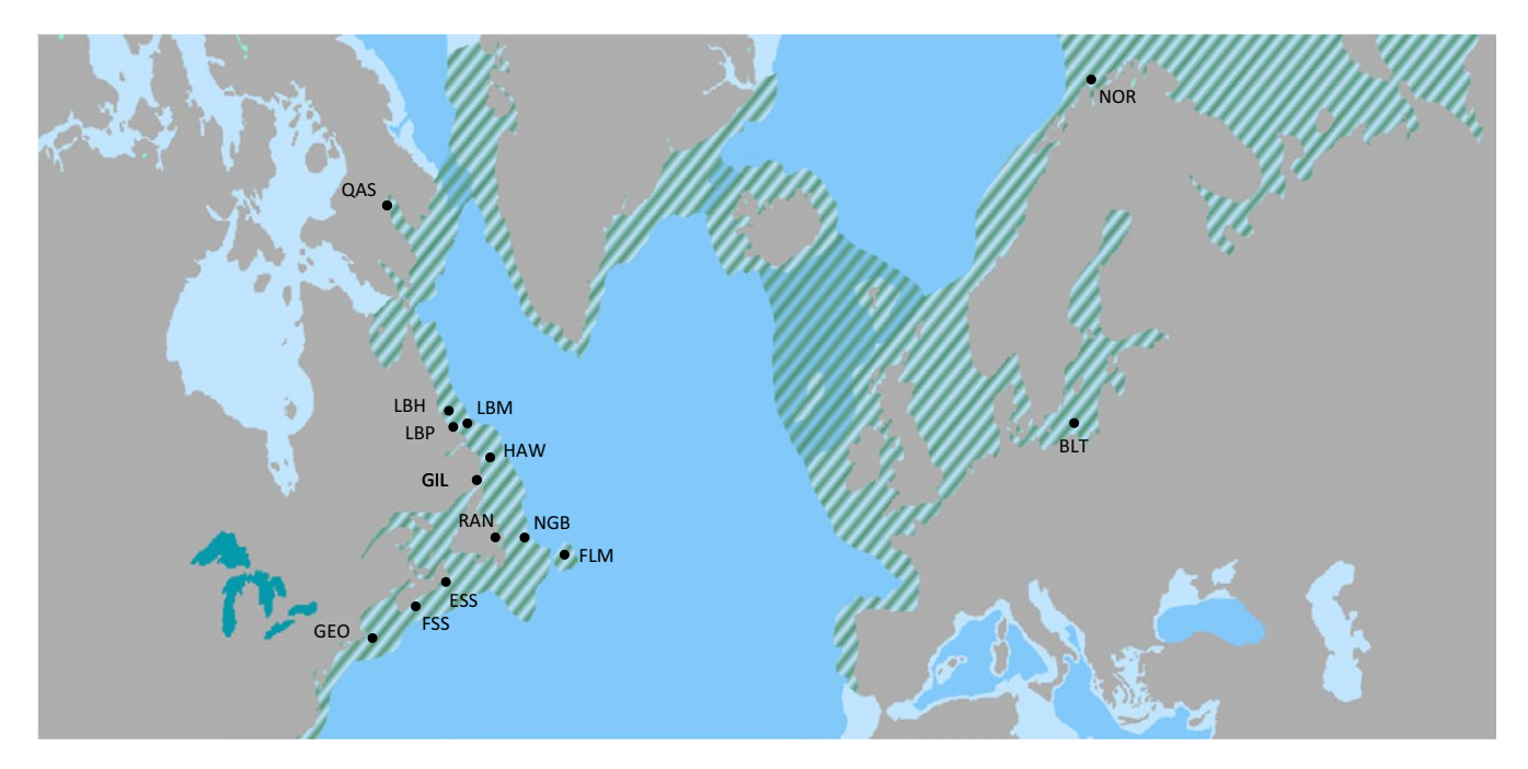
FIGURE 2 Distribution of Atlantic cod across the North Atlantic Ocean (shaded lines). Sampling locations, shown by circles, are as follows: QAS (Lake Qasigialiminiq, Nunavut), LBH (Hopedale, Labrador), LBM (Makkovik, Labrador), LBP (Postville, Labrador), HAW (Hawke Channel, Labrador), GIL (Gilbert Bay, Labrador), RAN (Random Island, Newfoundland), NGB (North Cape of the Grand Banks, Newfoundland), FLM (Flemish Cap), ESS (Eastern Scotian Shore), FSS (Fundy—Scotian Shore), GEO (Georges Bank), NOR (Norway at Tromsö), and BLT (Baltic Sea at Sopot). Figure modified from FishBase (2013)